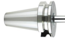
BT30 Jacobs Taper Chucks