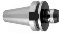
BT40 End Mill Holders