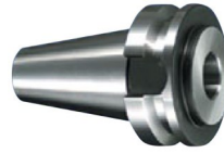
BT50 1.00" Holder For Tapping Heads