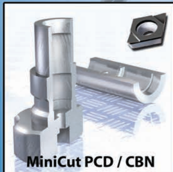
MiniCut PCD / CBN