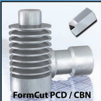
FormCut PCD / CBN