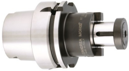
HSK-A63 MonoD' Shell Mill Holders