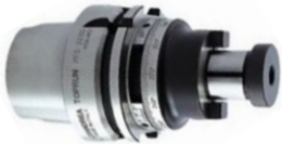
HSK-A63 TopRun Balanceable Shell Mill Holders