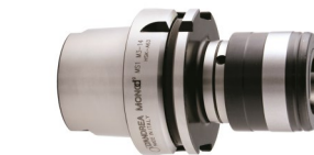
HSK-A63 MonoD' T/C Tapping Heads